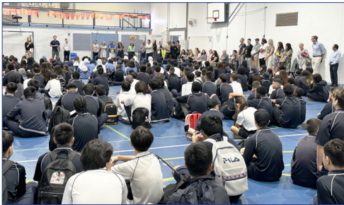
First day Assembly

Welcome to all of our new families, with more than 200 students enrolling this term, it has certainly been a very busy start to the school year. As a result of this increase in student numbers, we have also had quite a few contract teachers return to the school and have welcomed several new teachers.