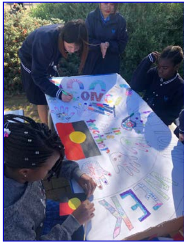
Students from different classes worked together on a banner

Each year from 27 May to 3 June, Australia recognises National Reconciliation Week which celebrates and builds on the respectful relationships shared by Aboriginal and Torres Strait Islander people and other Australians. The ultimate goal is to build strong and trusting relationships that enable us to work together.