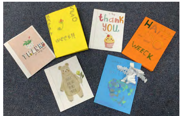
Earlier in the term, we celebrated the wonderful work done by our School Support Officers (SSOs) and Bilingual SSOs. Many students made them thank you cards to show their gratitude for all the support they provide.