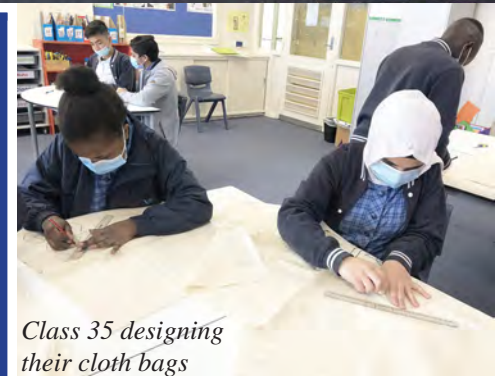
Class 35 designing their cloth bags