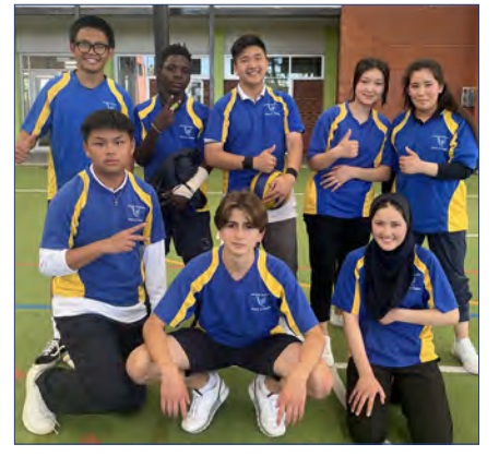
Term 4 inter school mixed volleyball team - 2<sup>nd</sup> place in the Western zone.